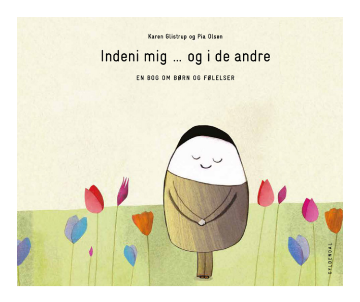
Published by: Gyldendal (DK) in 2016. 60 pages.