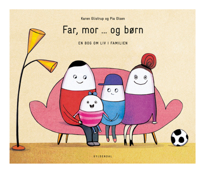
Published by: Gyldendal (DK) in 2018. 60 pages.