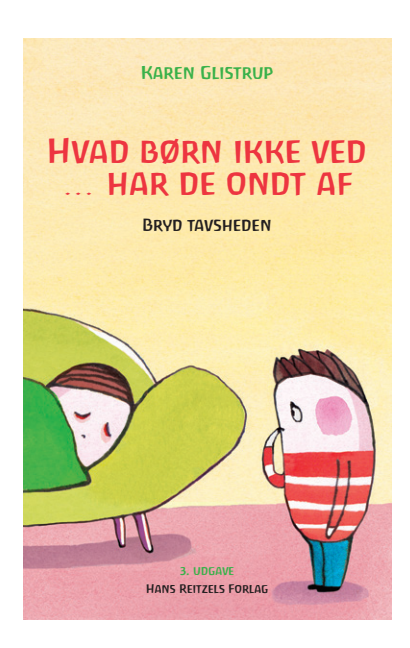
Publisher: Hans Reitzels Forlag (DK), 2014 Pages: 245. Original title: Hvad børn ikke ved... har de ondt af

Rights sold: Germany:Verlagsgruppe Beltz